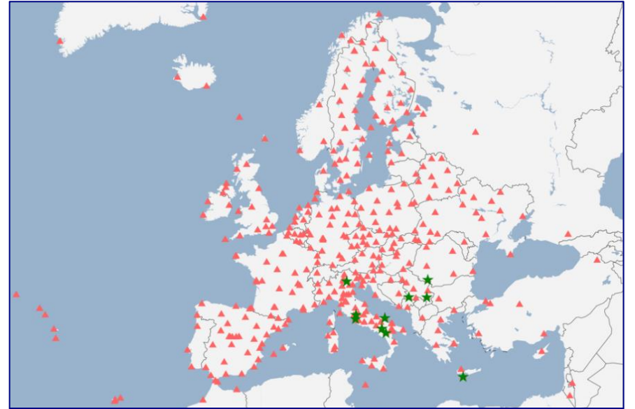
Figure 1. New GNSS stations (in green) integrated in the EPN in 2024.

The EPN Central Bureau (CB, https://epncb.oma.be ), managed by the Royal Observatory of Belgium, has continued its operational oversight of the EPN network in 2024, focusing on station performance in terms of data availability, metadata accuracy, and data quality. This year, 11 new GNSS stations were integrated into the EPN (highlighted in green in Figure 1: six in Italy, one in Greenland (not shown on the map), one in Greece, and three in Serbia). At the same time, six stations were decommissioned, including three in Ukraine, two in Great Britain, and one in Finland. Additionally, on December 4, the EPN CB transitioned to the IGS site log format v2.0, aligning the network with the IGS standards.